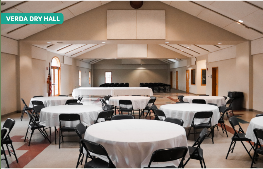
VERDA DRY HALL

YMCA Camp Hiawatha and Retreat Center indoor meeting spaces are perfect for gatherings of all types and sizes. Our facilities are designed to serve corporate retreats, adult groups, youth groups, family reunions, weddings, and more. All meeting spaces are equipped with central heating and air, restrooms, and wifi.