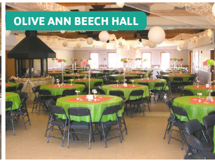
OLIVE ANN BEECH HALL